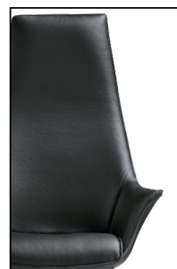
Particolare imbottitura liscia Flat pad detail