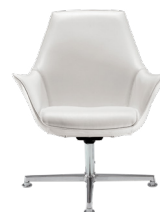
Imbottitura "liscia" "Flat" pad