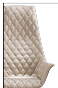
Particolare imbottitura romboidale "Rhomboidal" pad detail