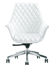
Imbottitura "romboidale" "Rhomboidal" pad

... raffinato design per l'ufficio presidenziale. ... refined design for managerial office. ... d'un design raffiné pour bureau de direction ... raffiniertes Design geeignet für Chefsbüros ... diseño refinado para la oficina de dirección.